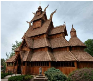
Stave Church at the Scandinavian Heritage Park